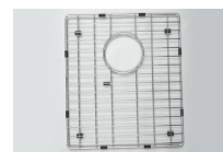
Model: G201715 Grid

Bosco Canada Inc. is known around the world for producing high quality kitchen sinks that incorporate modern design and functional superiority in every piece they manufacture.