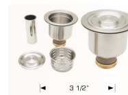
Model: 202012 Strainer

Bosco Canada Inc. is known around the world for producing high quality kitchen sinks that incorporate modern design and functional superiority in every piece they manufacture.