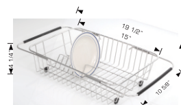
Plate Holder Model: 202030