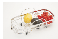
Fruit Basket Model: 202014