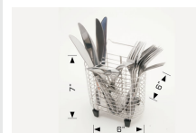
Model: 202015 Utensil Rack