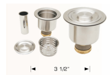
Model: 202012 Grid