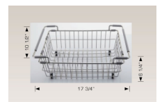
Model: 202041 Plate Holder

Bosco Canada Inc. is known around the world for producing high quality kitchen sinks that incorporate modern design and functional superiority in every piece they manufacture.